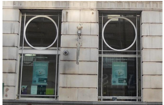
Existing External Advertisement Image