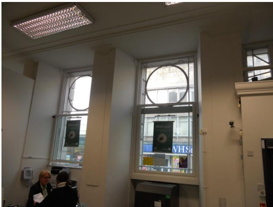
Existing Internal Advertisement Image

The Ground floor currently comprises of 3 no. marketing posters similar to the site photographs shown below, under this application we propose to remove all of these and replace with 1 no. internal cill mounted illuminated A1 poster units (Note: these are indicated in the images & proposed extract elevations further below)